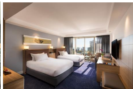
Superior Ocean View Twin Room

* Guests must sign up to Accor's Le Club AccorHotels loyalty programme which is free to join and can be completed during check in to receive complimentary in-room WiFi